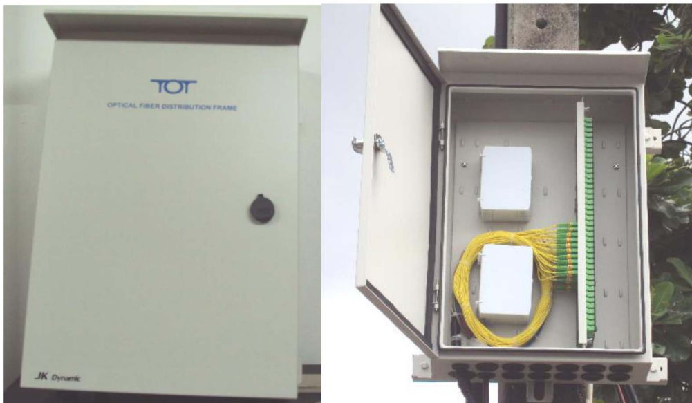
Aluminum Outdoor Wall Mount 240 F