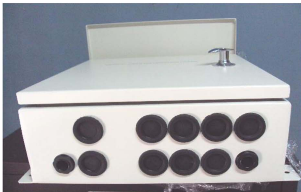
Aluminum Outdoor Wall Mount 48 -120 F