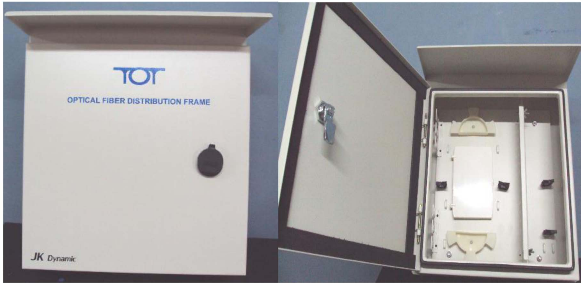
Aluminum Outdoor Wall Mount 12 -24 F